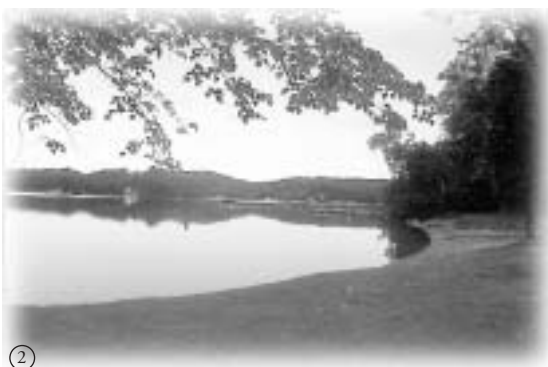
Nearby beach in Hillside